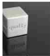
Multi-factor All Cap Monthly