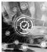
All Cap Weekly