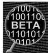
Low-beta Large Cap Weekly