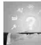
US Sector Sentiment Weekly